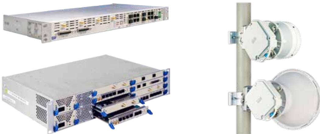
AGS20 SERIES IDUs and ODUs

COMPANY WITH QUALITY SYSTEM CERTIFIED BY DNV GL = ISO 9001:2015 =