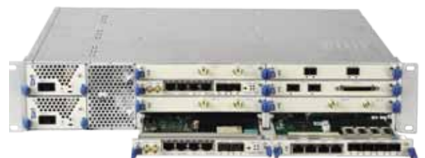
AGS20L 2RU - 8 modular slots

AGS20L aggregates traffic incoming from multiple IF based ODU and Ethernet based full outdoors, all feeding into a single node. Its modular design offers full redundancy (no Single Point of Failure) regardless of the radio configuration, improving resiliency of aggregation and backbone sites.