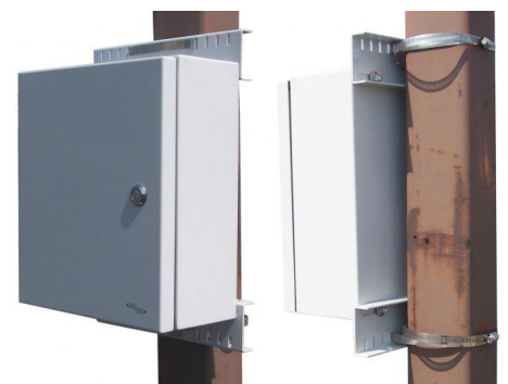
Flexible mounting options