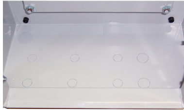
Knockouts for Antenna Ports