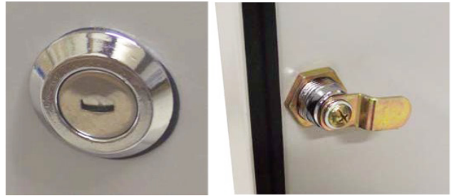
Enclosure Key Lock