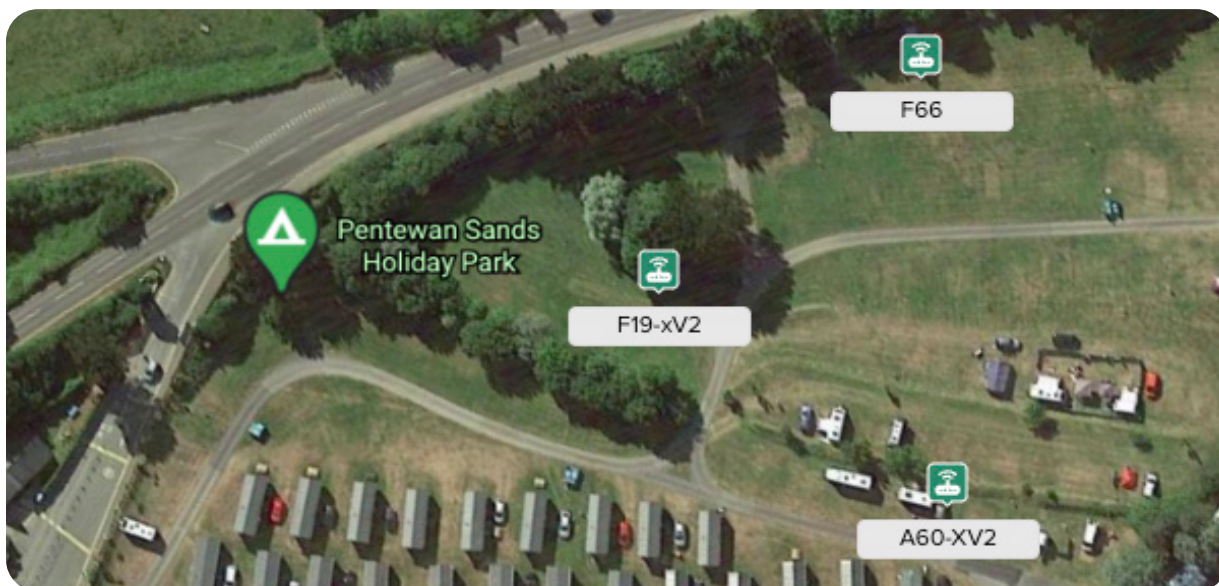
A close-up view of XV2 Wi-Fi 6 access point locations at the Pentewan Sands Holiday Park.

Coverage now stretches to 95 percent of the site, excluding a wooded area which is reserved for people who want a less digitally enabled visit. The purpose-built outdoor equipment from Cambium Networks with its sealed glands means that neither the weather nor local creepy crawlies now pose an issue to Wifi Solutions Ltd.