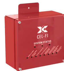
Remote Annunciator Panel (RA)

The Cel-Fi RED Remote Annunciator (RA) provides automatic supervisory signals for malfunctions of Cel-Fi ERCES public safety solutions. In addition to being NEMA 4 rated and complying with NFPA and IFC fire codes, the RA features PoE architecture for quick installation and alarm configuration with Cel-Fi QUATRA RED or SOLO RED installations. The RA also offers real-time component monitoring through the Cel-Fi WAVE Portal.