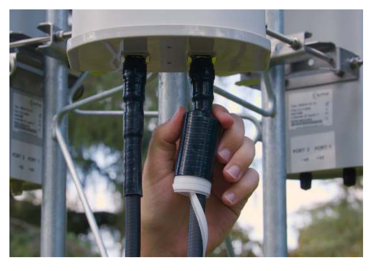
The Optimal Weather-Proofing Choice

For the past few years AT&T has been utilizing Gamma Electronics' Cold Shrink and has issued CEQ numbers for these products to make the purchasing process on these products even easier for telecommunications professionals.