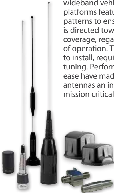
Product images (trooper inside elements, chrome coil antennas)

In addition, PCTEL offered ultra-wideband vehicular antennas. These platforms feature optimized radiation patterns to ensure that the RF energy is directed towards the desired area of coverage, regardless of the frequency of operation. These antennas are ready to install, requiring no additional field tuning. Performance and installation ease have made PCTEL's wideband antennas an industry staple for LMR mission critical communications.