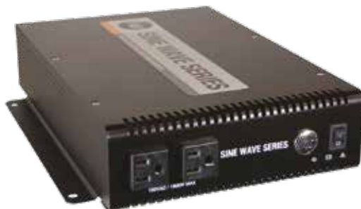
115 VAC Output Model Shown

1500 Watt DC to AC Pure Sine Wave Inverter for 115 Volt AC Applications