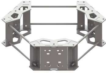
Universal Ring Mount, 10 in to 30 in OD