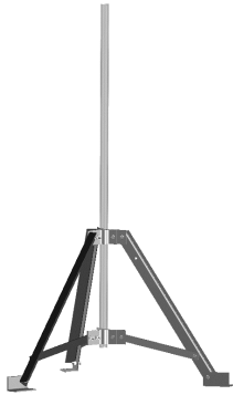
Universal Tripod Mount, base only, pipe not included