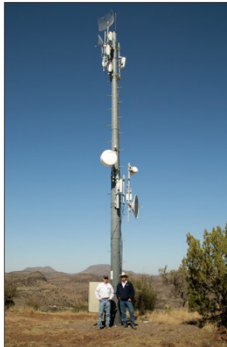
Tower with backhaul and Access Points