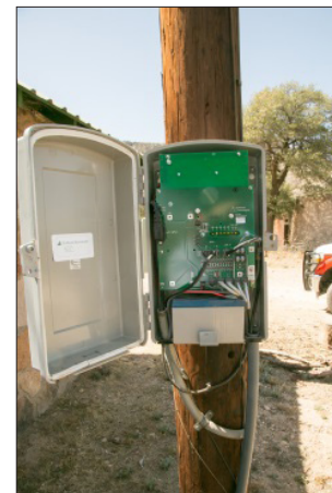
Thinroute Residential Gateway for VoIP Services

As more customers leave cable and stream video over broadband, BBT is providing a clean streaming service that works consistently with no buffering.