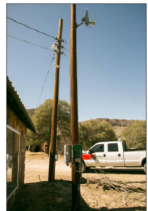
Subscriber Module at Customer Location